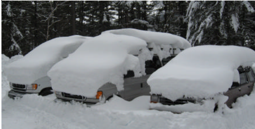
Winona's fleet of vans March 2009

As Spring struggles to arrive, we're still digging out here on the shores of Moose Pond