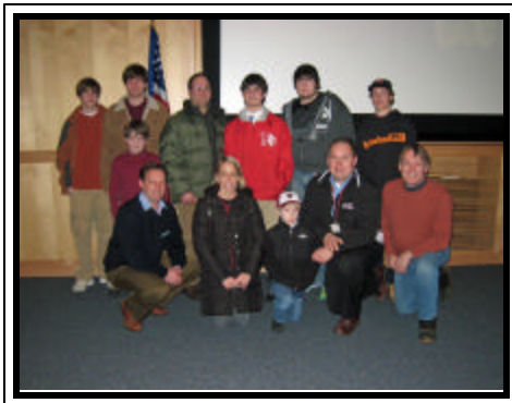
Lexington MA January 11, 2009

It's Mid Winter here on the shores and as we wrap up the area gatherings, we can really start looking forward to the camping season ahead.