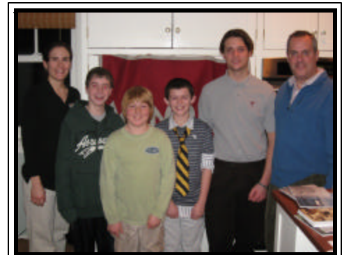
Barrington RI January 14, 2009