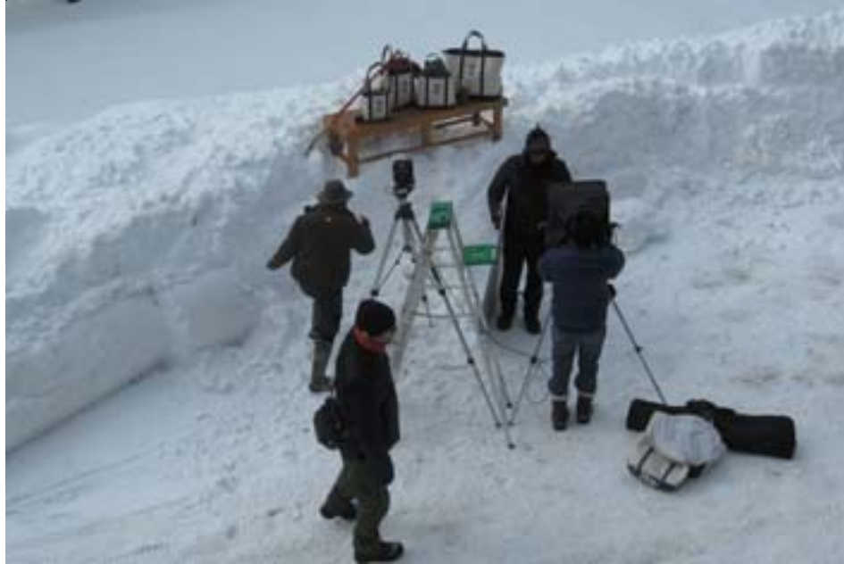
L.L. Bean crew and totebags in front of the Junior Wiggy

Winona is busy preparing for summer on the shores and L.L. Bean is busy shooting their Winter 2008/2009 catalog.