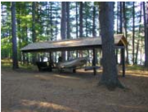
War Canoe Pavillion