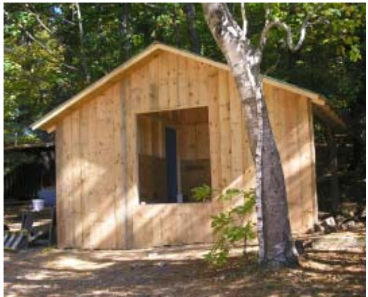
Construction of Fluffy's new transfer station and recycling center is underway. . .