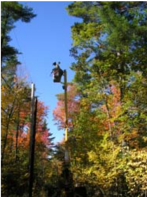
Way up in the air is the man in the 'cherry picker' as he works his way down the Winona power line.

Don't forget to sign up for '101 Tons of Fun' and the 2008 ADVANCE GUARD!!